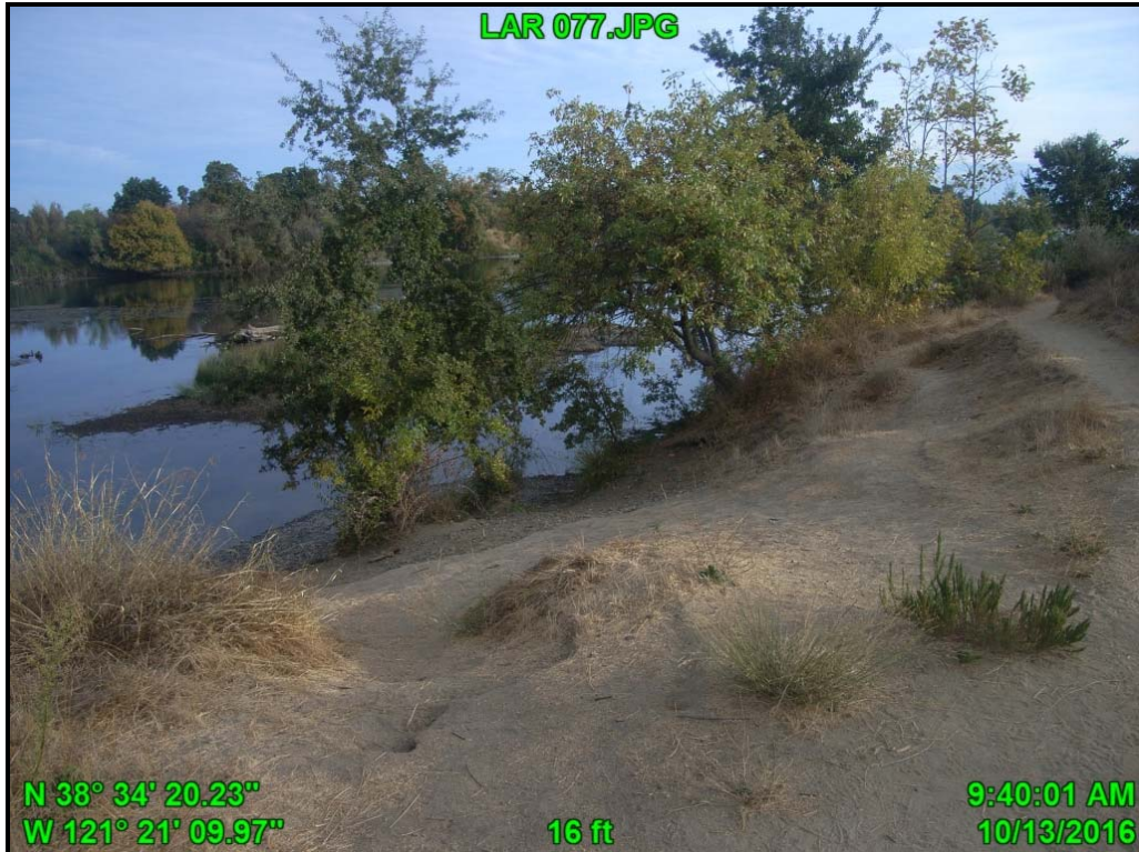
Photograph 2 – LAR RM 10.9L (2)