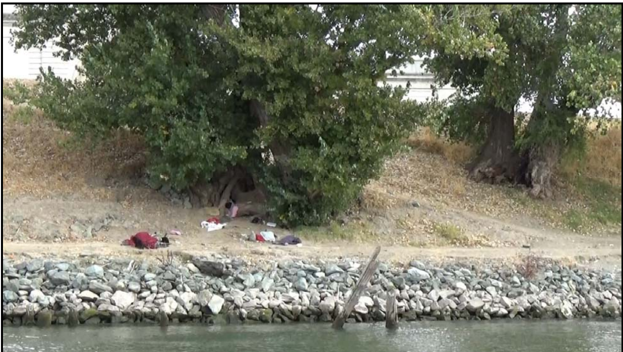
Photograph 26 - SR RM 60.1L (1)