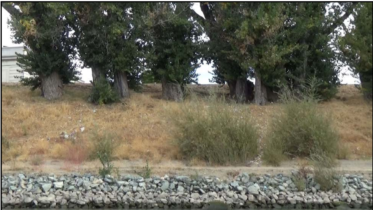
Photograph 28 - SR RM 60.1L (3)