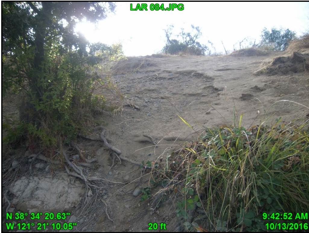
Photograph 3 – LAR RM 10.9L (3)