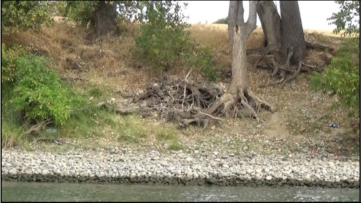
Photograph 25 - SR RM 60.3L (4)