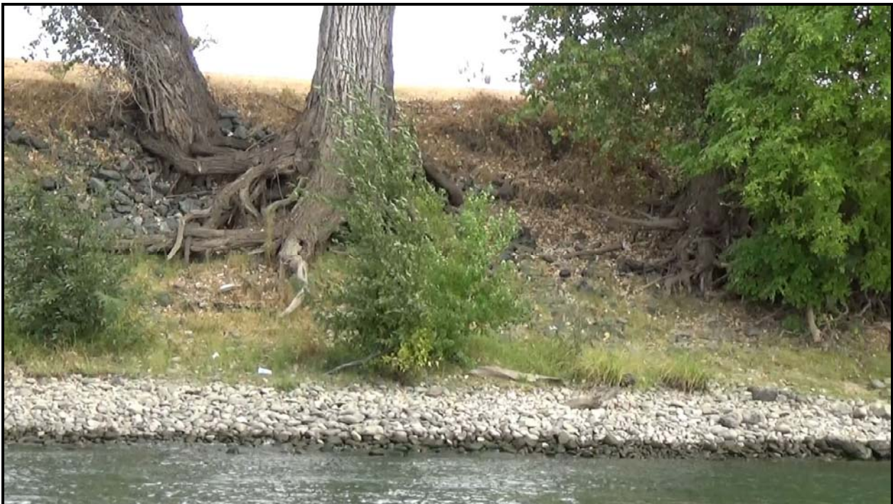
Photograph 24 - SR RM 60.3L (3)