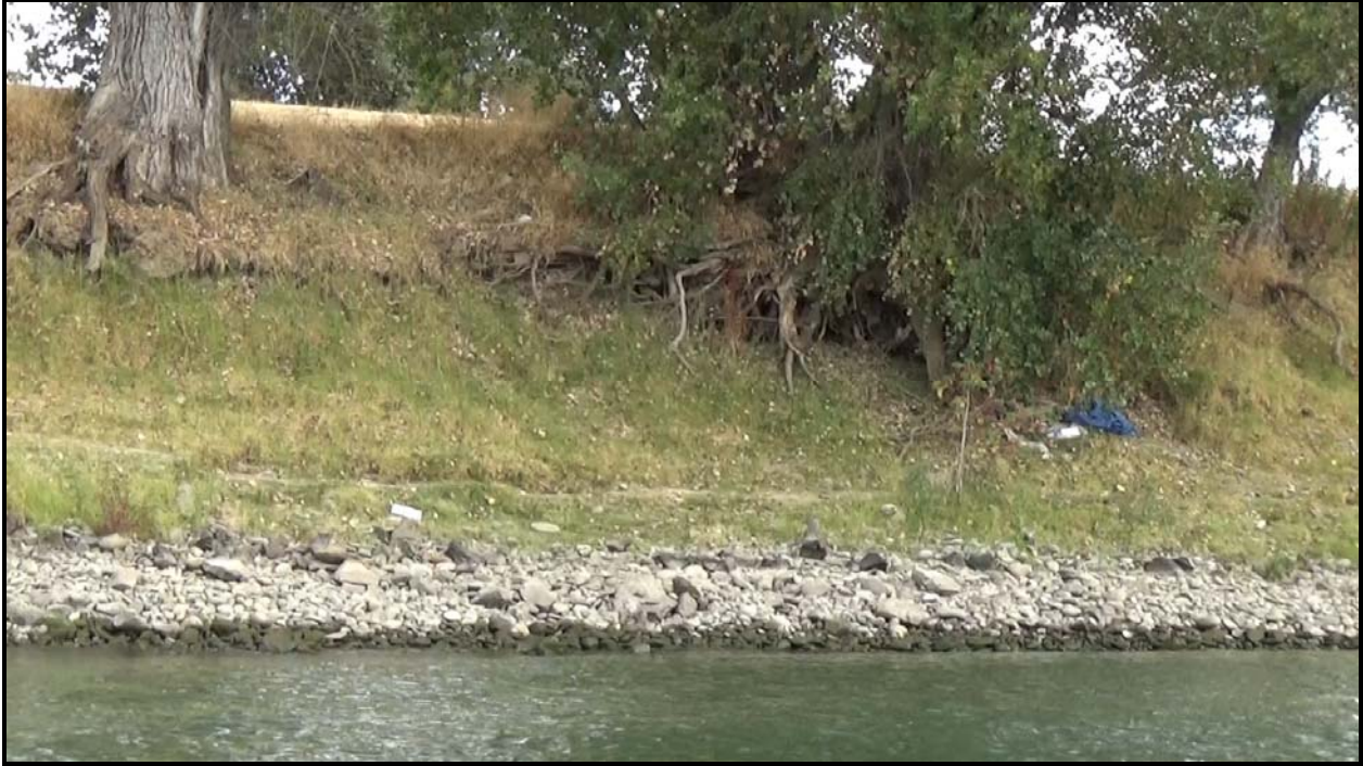
Photograph 23 - SR RM 60.3L (2)