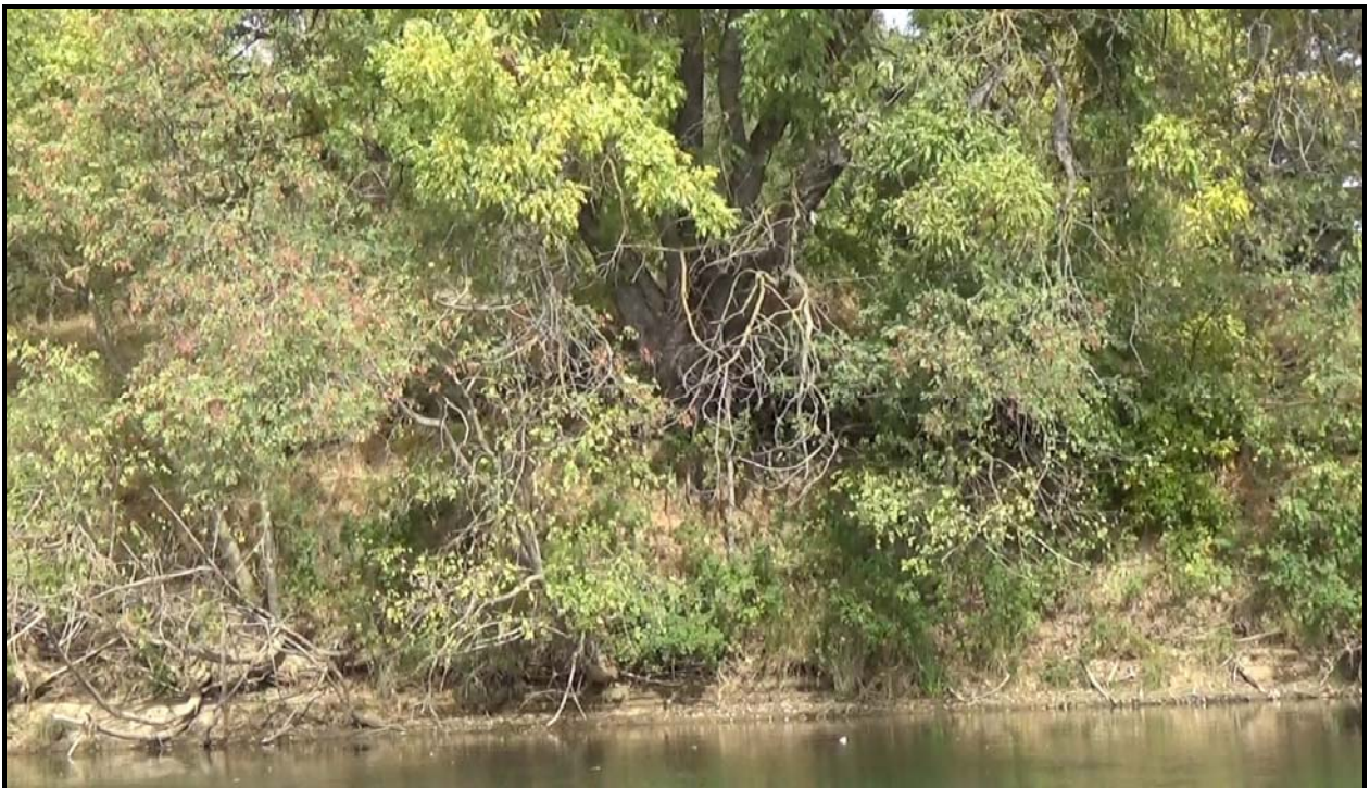
Photograph 16 - LAR RM 7.5R (1)