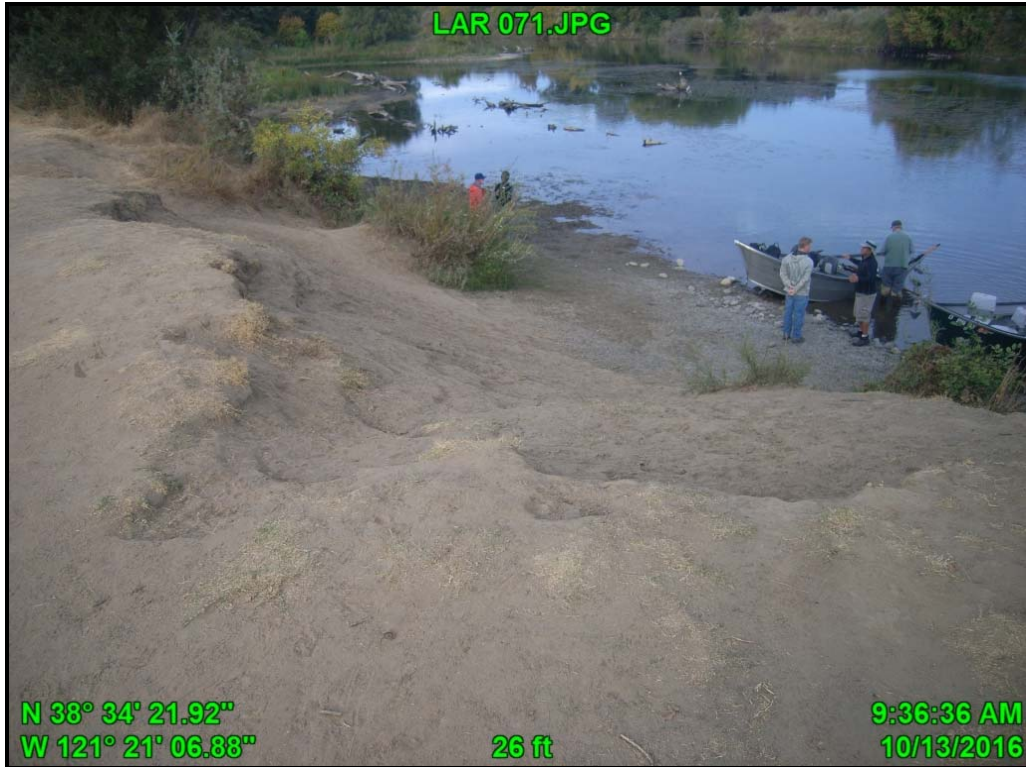
Photograph 1 – LAR RM 10.9L (1)