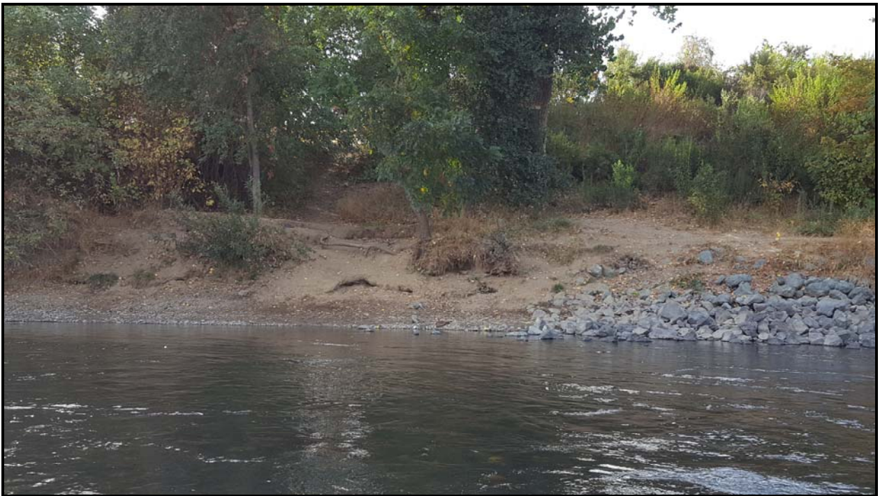
Photograph 10 – LAR RM 10.5L (5)