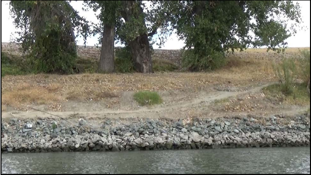
Photograph 29 - SR RM 60.1L (4)