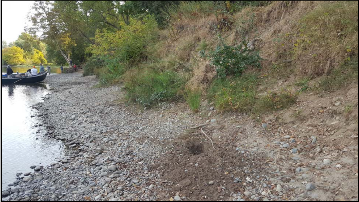
Photograph 7 – LAR RM 10.5L (2)