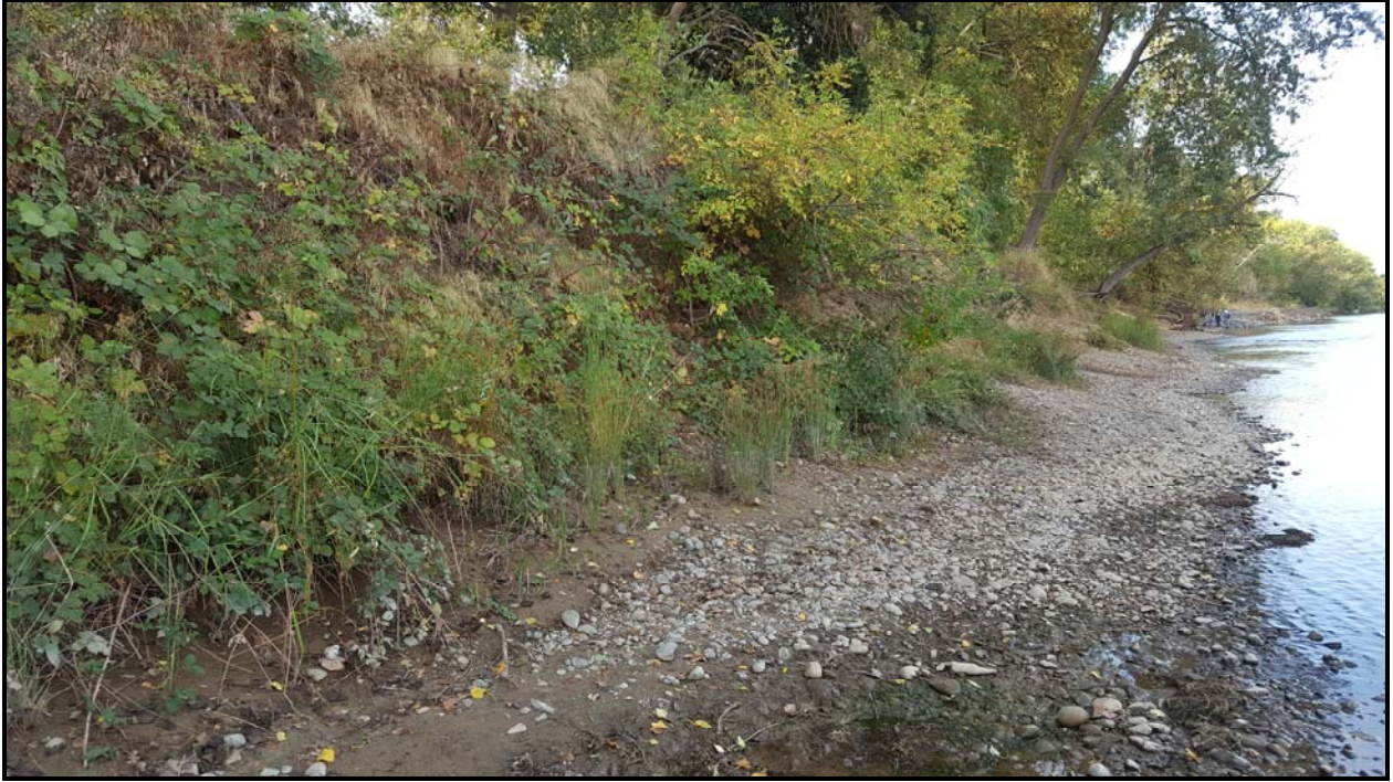
Photograph 9 – LAR RM 10.5L (4)