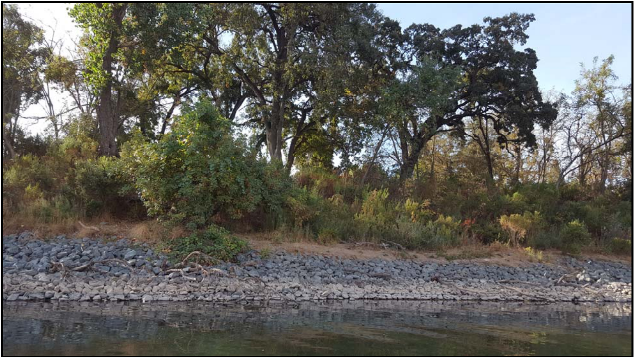
Photograph 12 – LAR RM 9.8L (2)