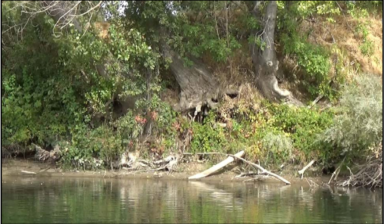
Photograph 19 - LAR RM 7.5R (4)