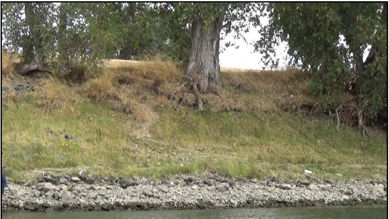
Photograph 22 - SR RM 60.3L (1)