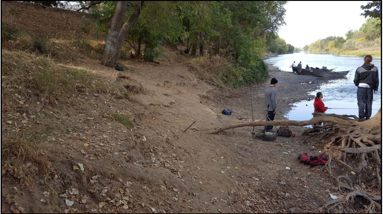
Photograph 6 – LAR RM 10.5L (1)