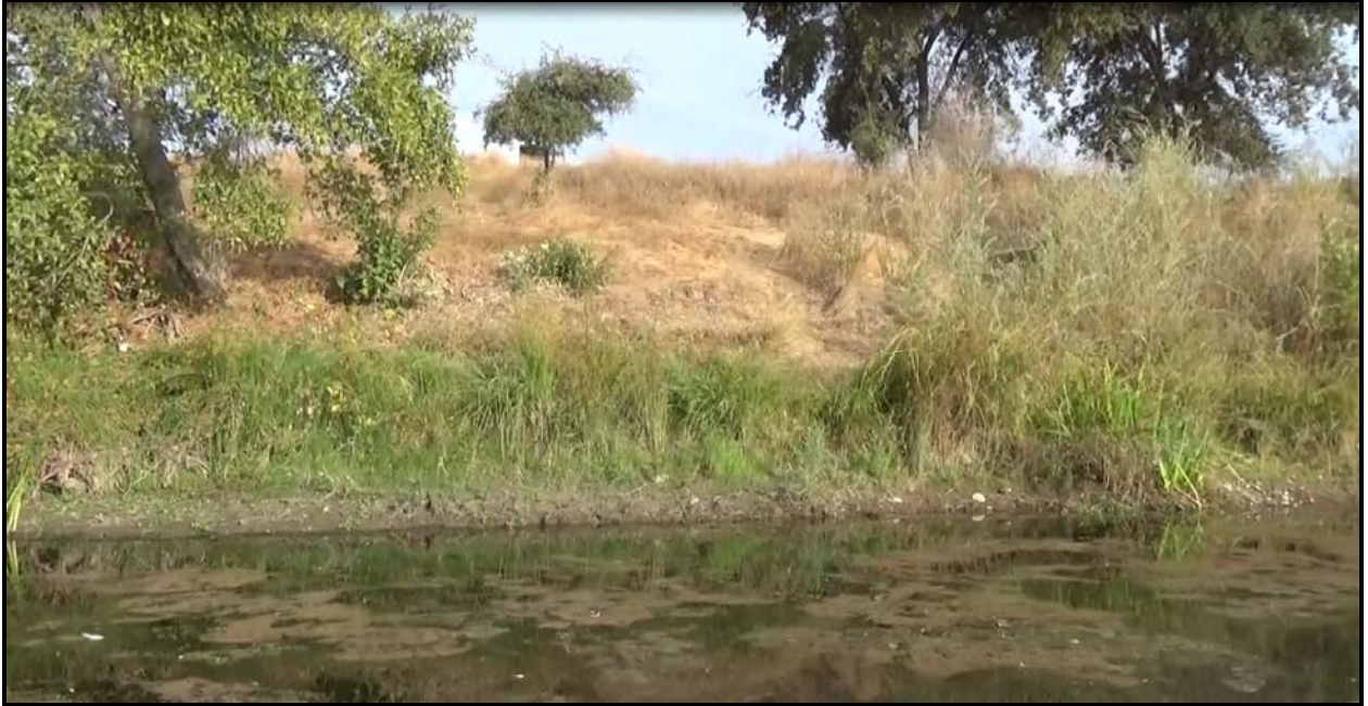
Photograph 5 – LAR RM 10.8R