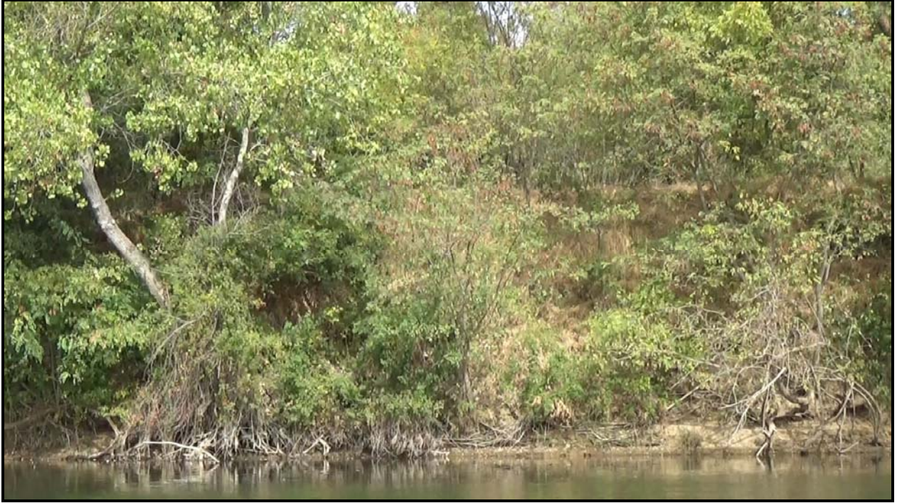
Photograph 17 - LAR RM 7.5R (2)