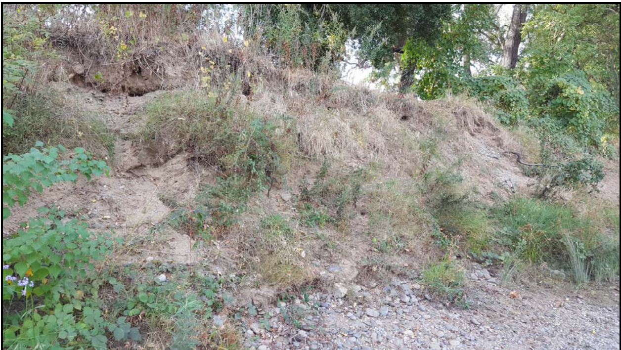
Photograph 8 – LAR RM 10.5L (3)