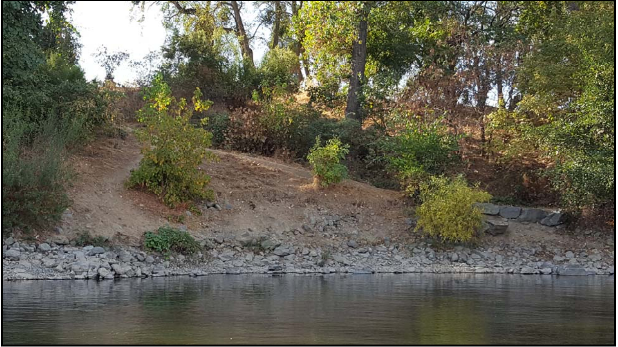
Photograph 13 – LAR RM 9.8L (3)