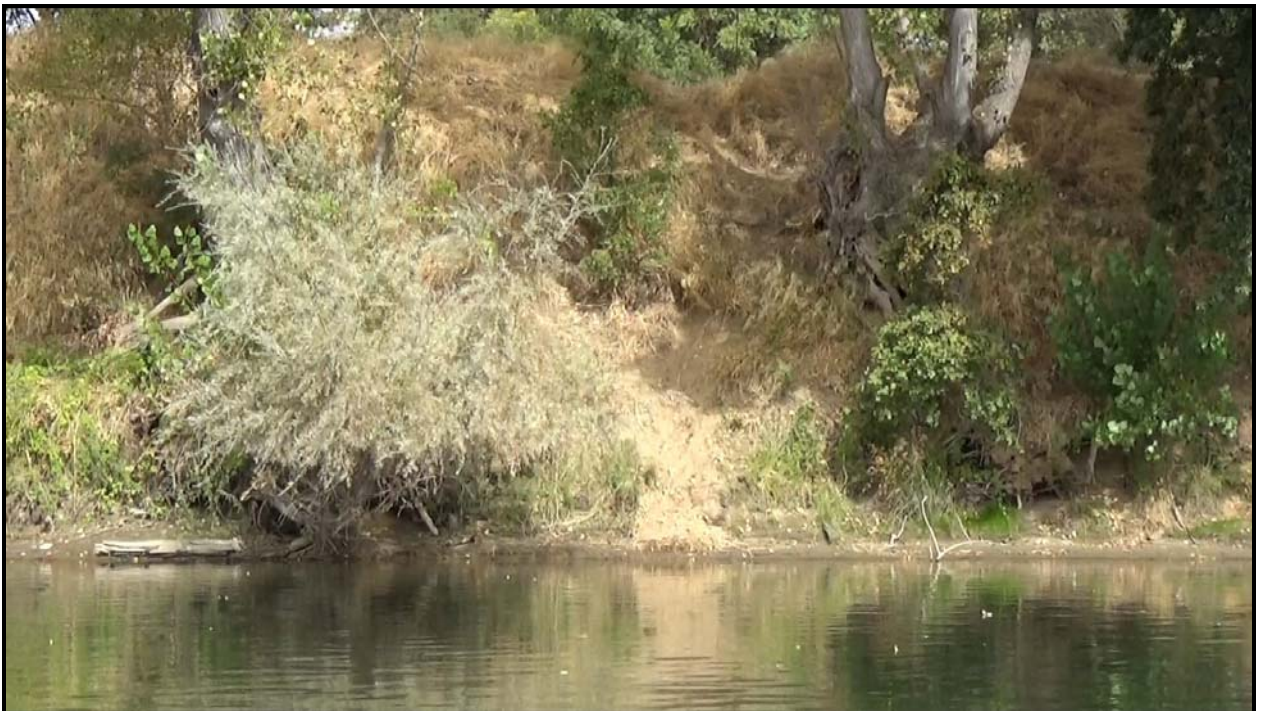
Photograph 18 - LAR RM 7.5R (3)