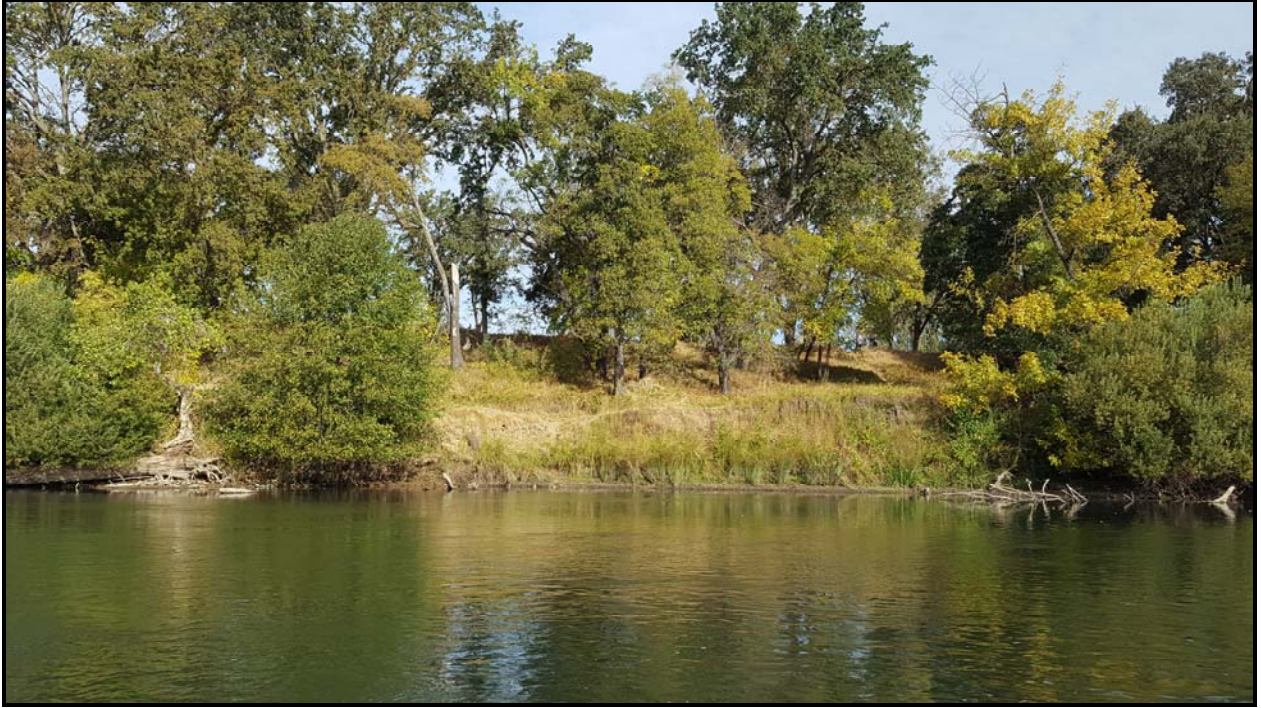
Photograph 15 – LAR RM 8.8R (2)