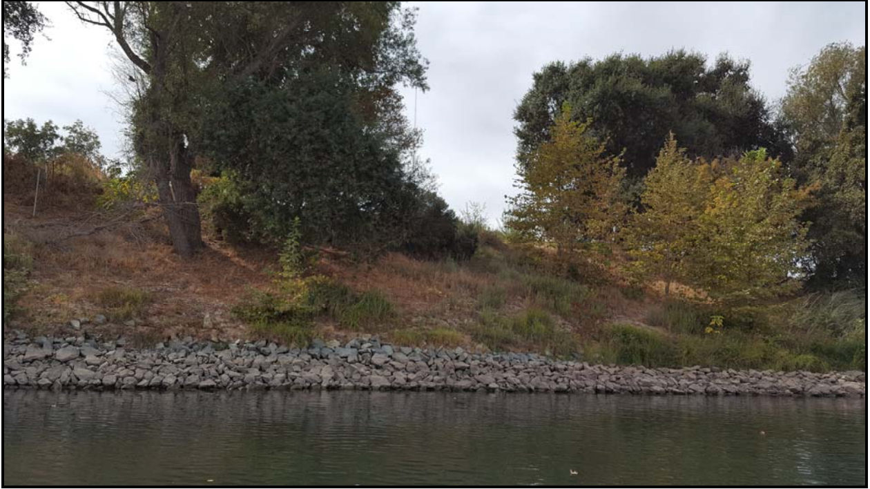
Photograph 21 - LAR RM 2.7L (2), repair site