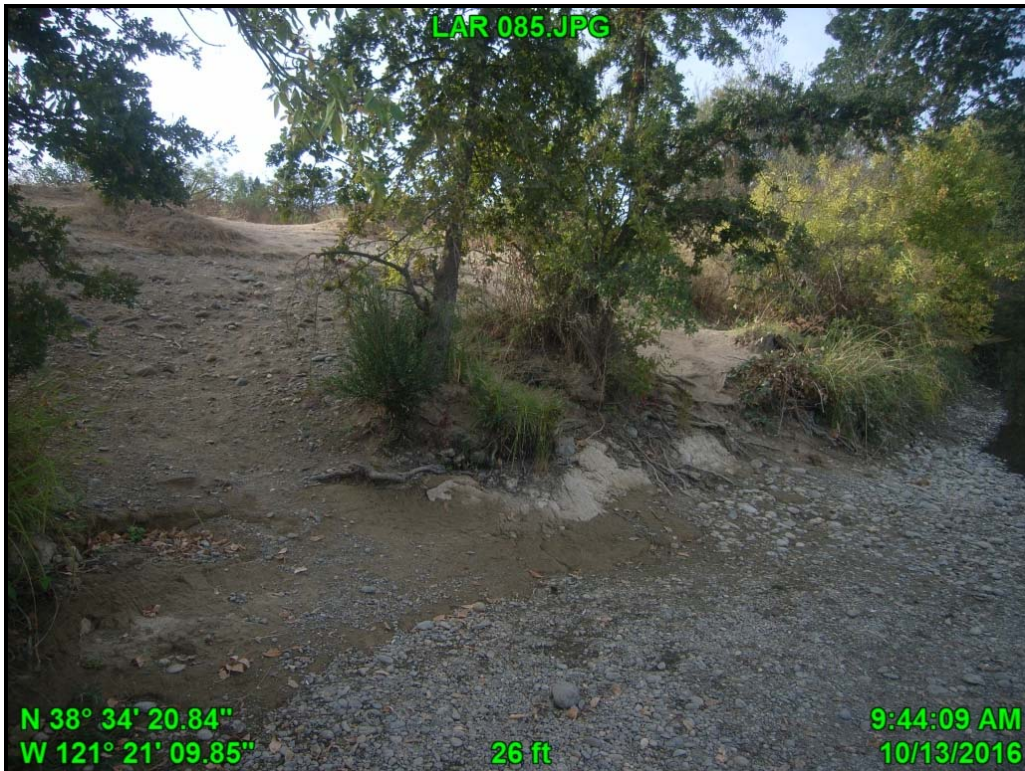
Photograph 4 – LAR RM 10.9L (4)