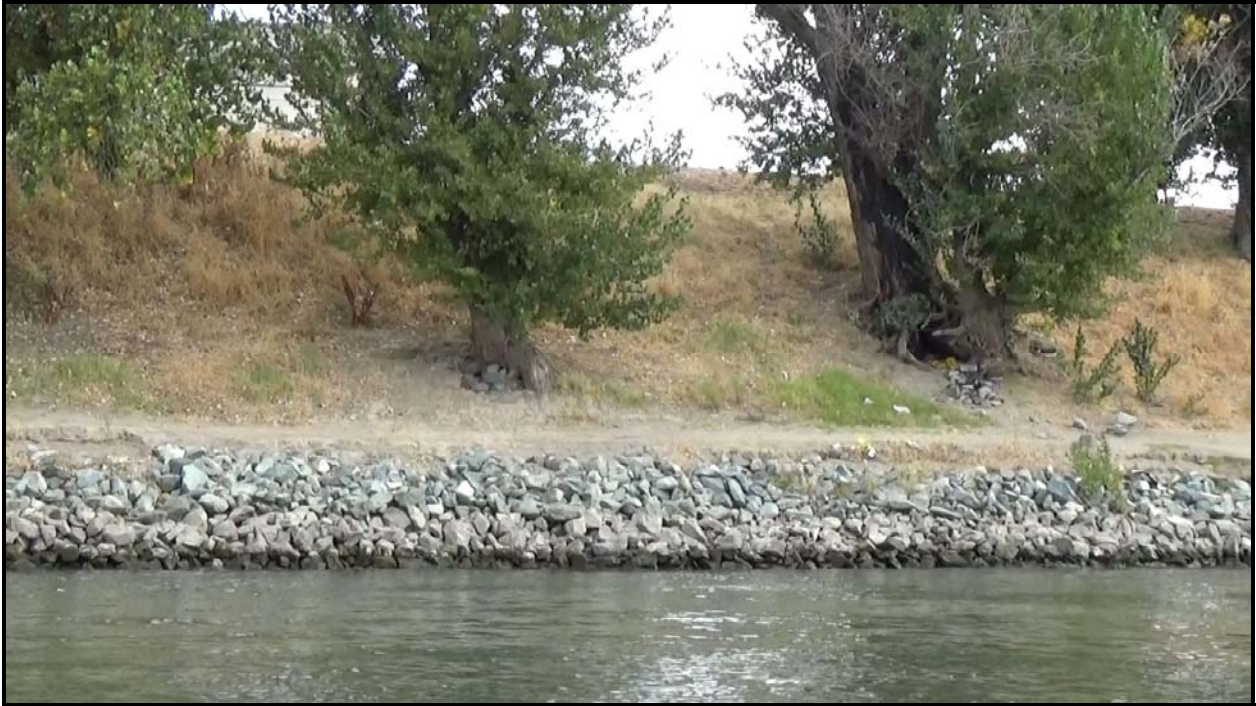
Photograph 27 - SR RM 60.1L (2)