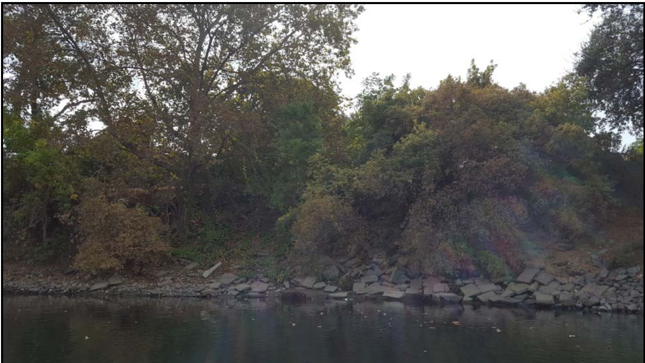
Photograph 20 - LAR RM 2.7L (1), upstream of repair site