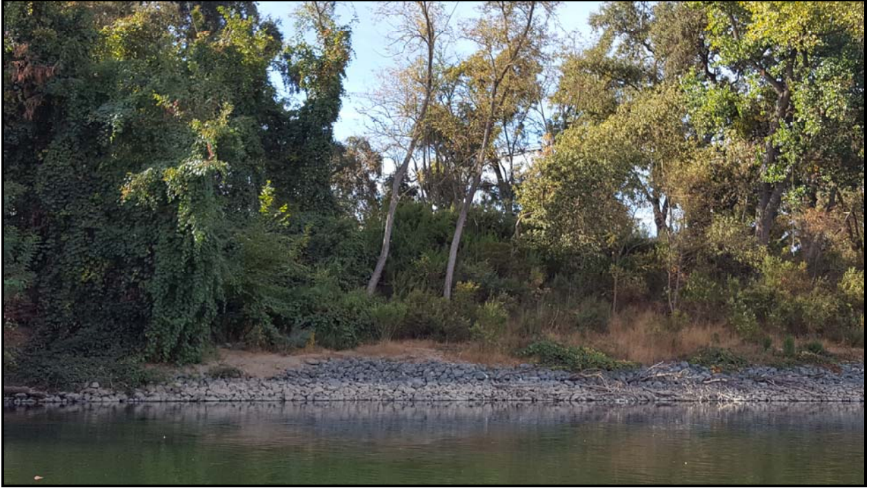
Photograph 11 – LAR RM 9.8L (1)