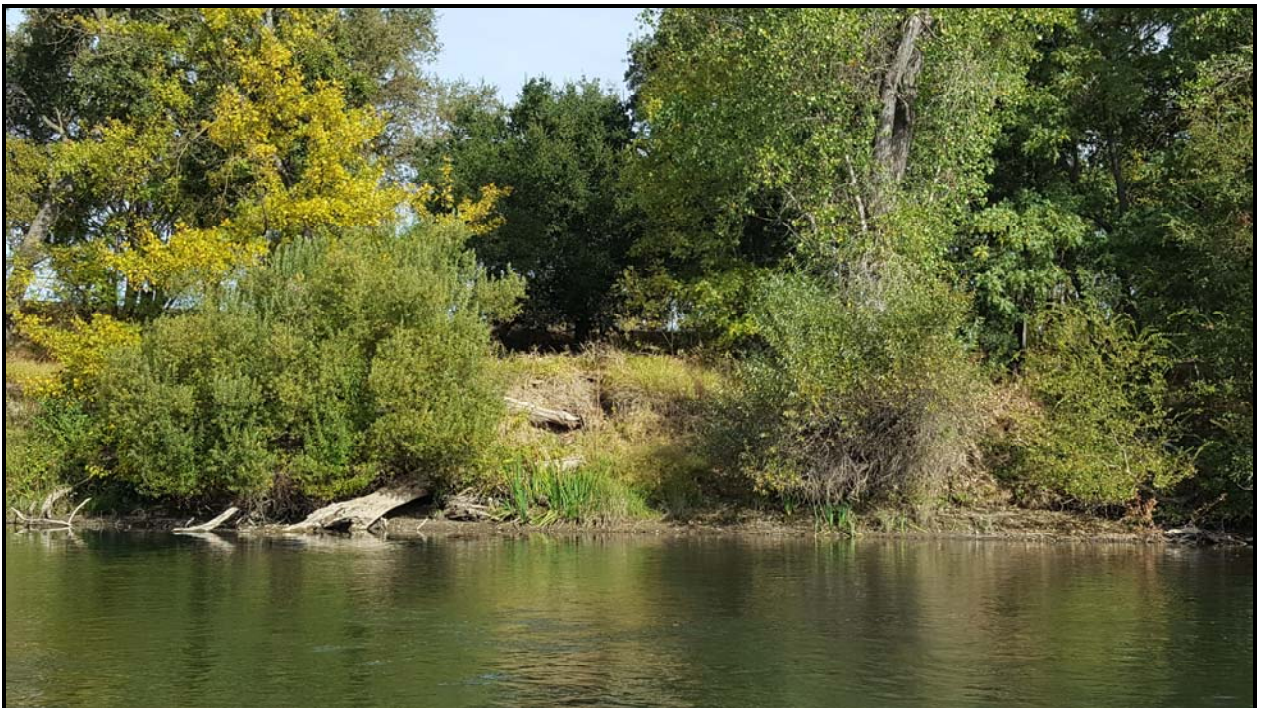
Photograph 14 – LAR RM 8.8R (1)