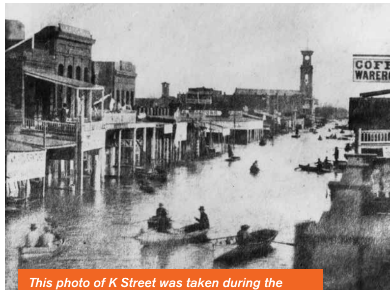
This photo of K Street was taken during the flood of January, 1862.

To learn more about the problems identified by the USACE and the risks they present, as well as to view the SWIF documents, go to arfed.org/notices .