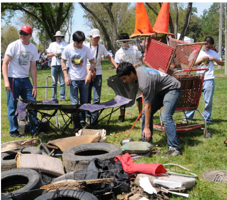
Volunteers gather at the celebration to create sculptures for the "Junk & Gunk Contest"