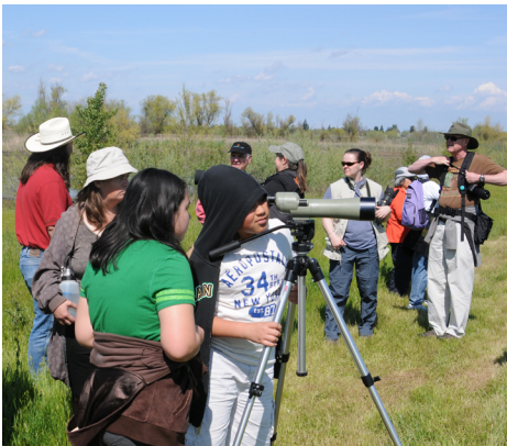
Activities during Creek Week include a "Birds & Bloom Tour" of the Bufferlands