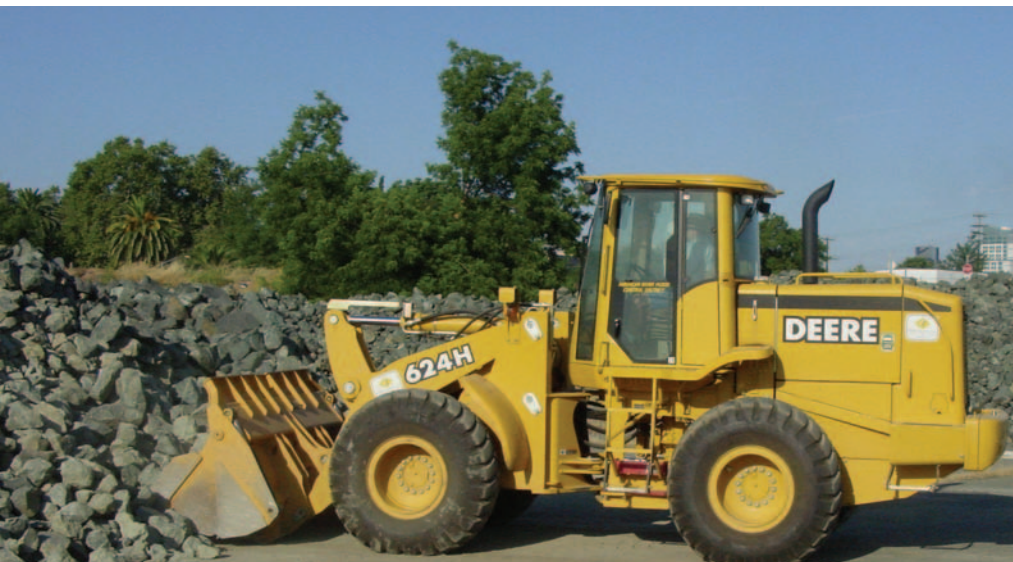
The District crew stockpiles rock for possible use this winter.

Our District sponsored AB 107 which was signed by the Governor last year. It allows urban areas to adopt safer standards than currently embodied in the State's regulations. Our District intends to develop and implement revised levee standards. These standards will address issues such as new levee encroachments by residents including fences, walls, gardens, vegetation, structures and other problematic intrusions onto the levee and adjacent areas. Current standards for levee crossings and access by public agencies, utility companies and others will also be amended as appropriate to improve levee safety. A series of community meetings will be held as the new standards are drafted. Finally, the District will review its emergency response procedures and make changes as necessary based on our past experiences plus lessons learned from other recent flood events including New Orleans.