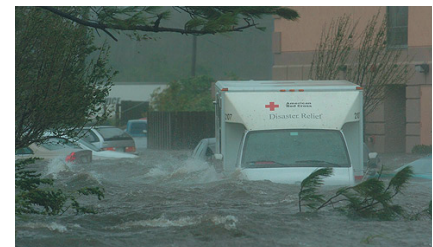
New Orleans, 2005