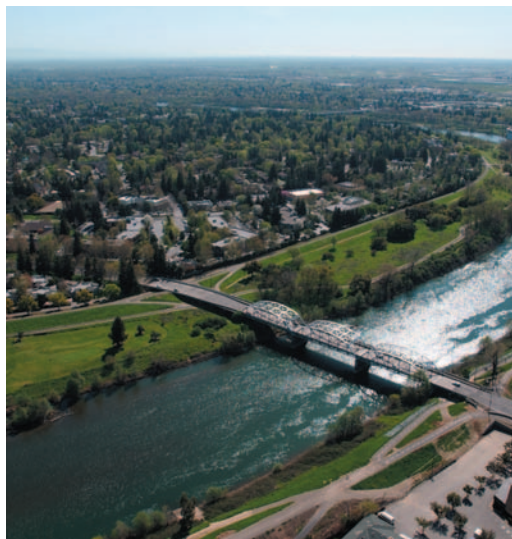
American River levees near H Street protect houses in Campus Commons and River Park.

What we are doing to reduce our flood risk, story inside.