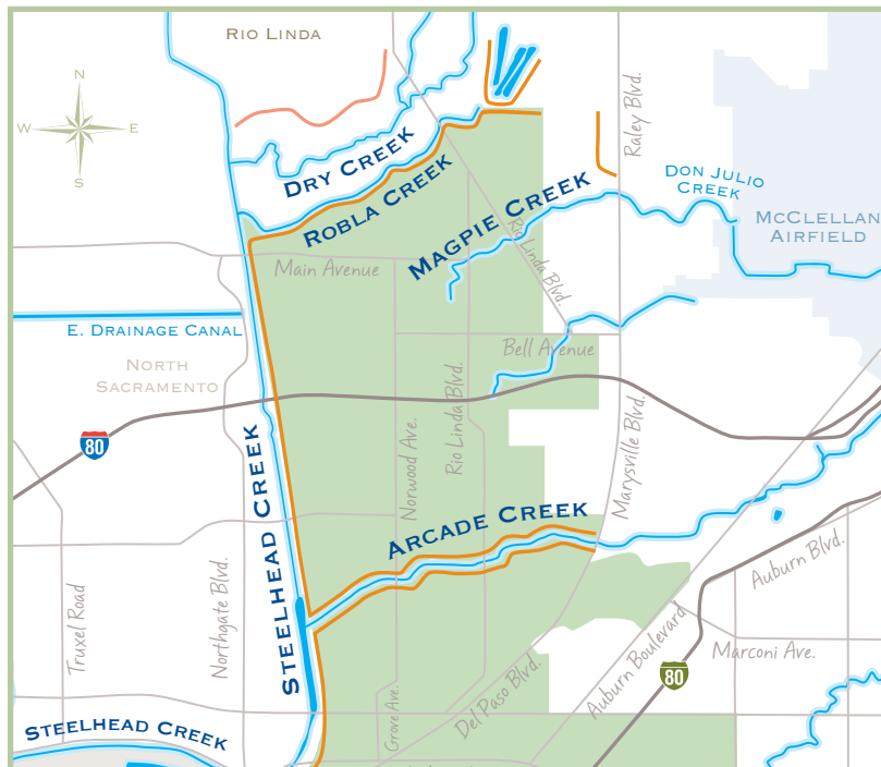
The shaded green area shows the district boundaries and the orange lines show the levees.

For property owners, the project provides a benefit beyond better flood protection. Bringing the levees up to the more stringent federal levee accreditation standards will also allow homeowners and commercial property owners in flood-risk zones to purchase more affordable flood insurance.